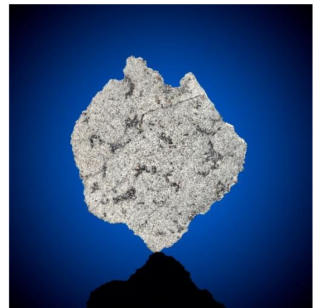
NWA 11057 — LARGE COMPLETE SLICE OF THE PLANET MARS WITH ENTRAPPED MARTIAN ATMOSPHERE MARS ROCK – SNC DIASBASIC SHERGOTTITE SAHARA DESERT, NORTH WEST AFRICA Estimate: $30,000-50,000

PRESS CONTACTS: Lara Messerlian | 212 707 5923 | lmesserlian@christies.com