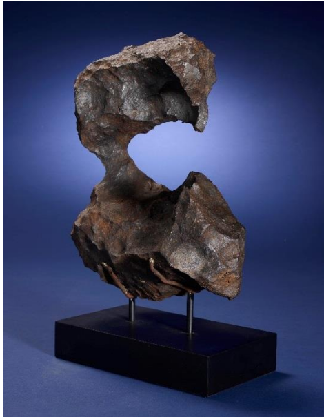
GIBEON METEORITE — NATURAL EXOTIC SCULPTURE FROM OUTER SPACE IRON, FINE OCTAHEDRITE GIBEON, GREAT NAMA LAND, NAMIBIA Estimate: $250,000-350,000

New York – Christie's announces its auction The Moon and Beyond: Meteorites from the Stifler Collection , which will be open for bidding from July 11 - 25 with estimates ranging from $700 up to $350,000.